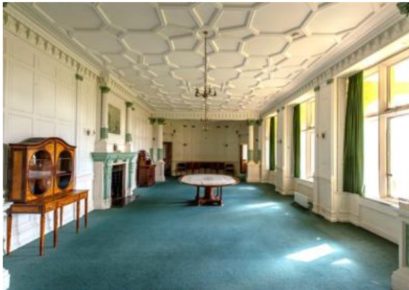
Dining Room - £1500 +vat

Jacobean in styling with impressive countryside views the Dining Room is perfectly suited to private dining and events up to 50 guests.