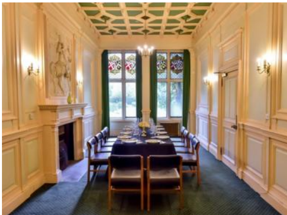
The Green Room - £950 +vat

Jacobean in styling with impressive countryside views the Dining Room is perfectly suited to private dining and events up to 50 guests.