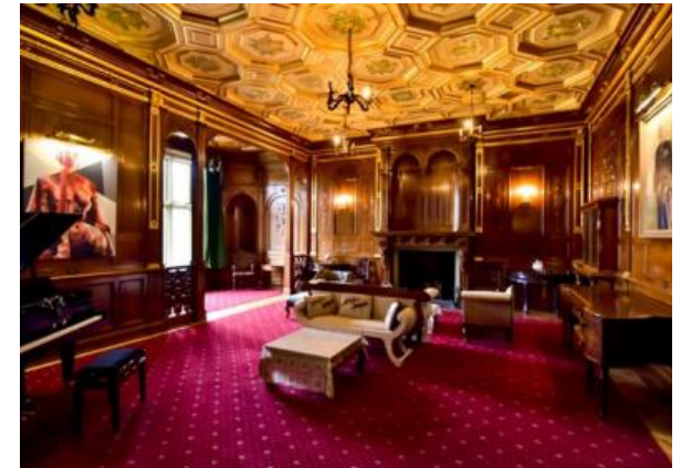
The Bar Room - £1250 +vat

The most favoured room in the Manor House panelled in Spanish walnut, with a striking gilded ceiling, the Drawing Room is a superb space for a drinks reception up to 25 guests and with the Bar Room up to 50 guests.